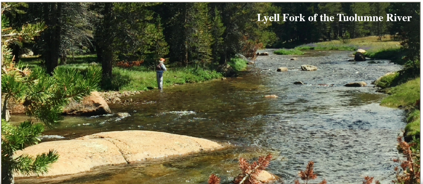
Lyell Fork of the Tuolumne River

FLY FISHERS INTERNATIONAL Southwest Council